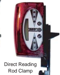
Direct Reading Rod Clamp